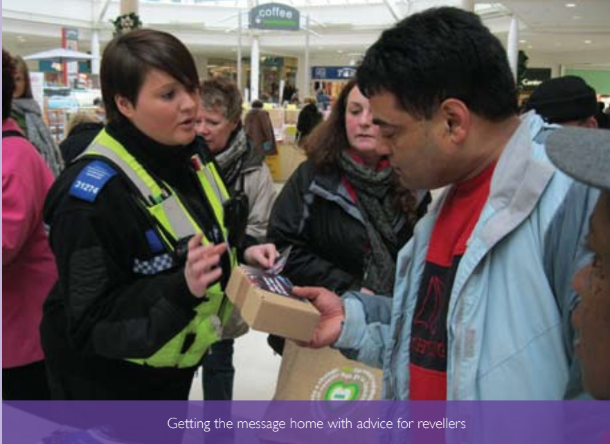
Getting the message home with advice for revellers