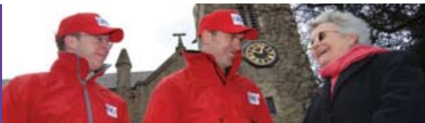
Rugby Rangers offer help and support to businesses and the public