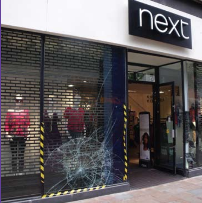
Smashed windows in a Dudley Street Store

Retailers, the Police, camera operators, transport providers, pubs and clubs were passing on valuable information before and during the riots in Wolverhampton through the city's Radio Link scheme.